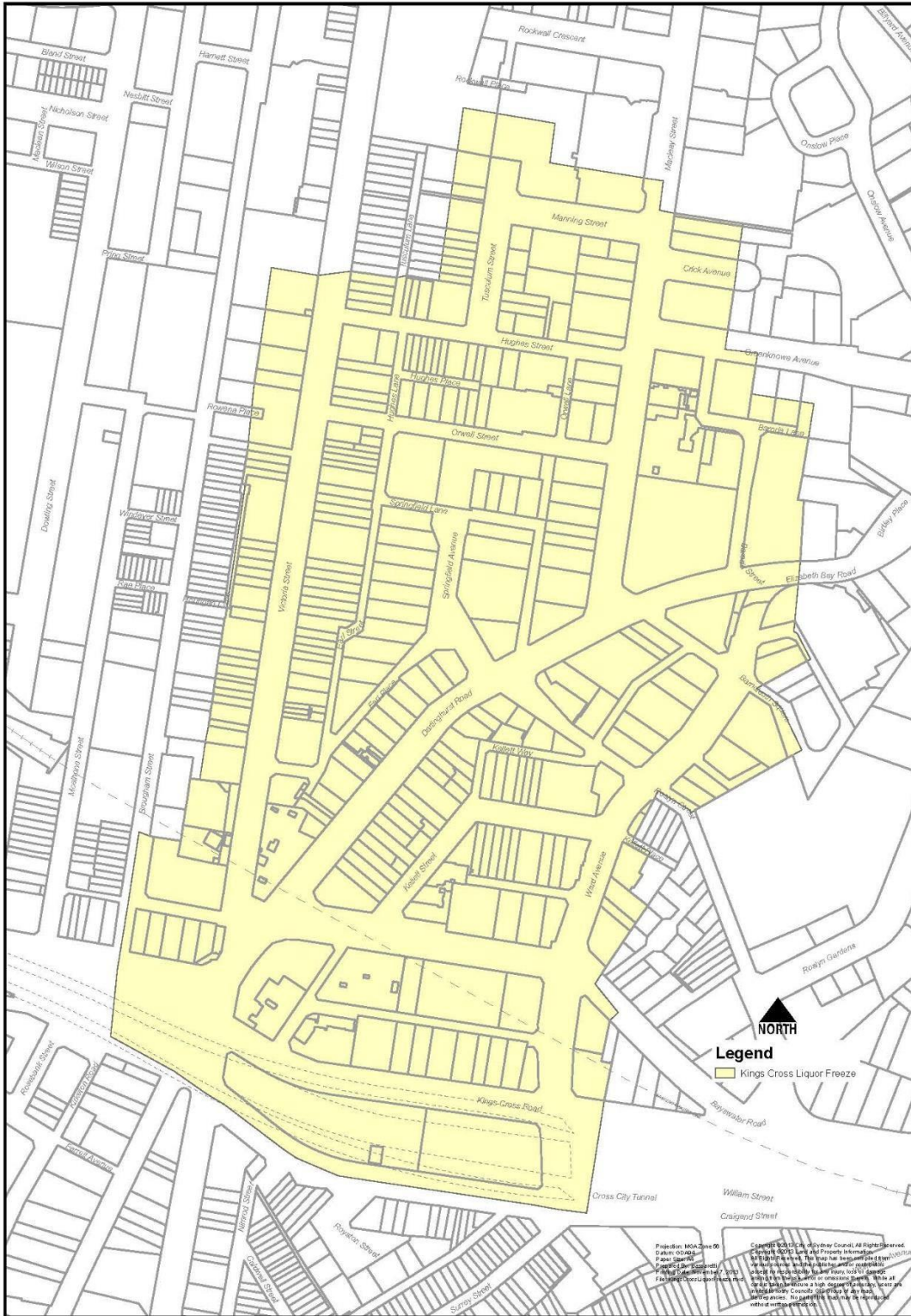
Kings Cross Precinct Liquor Accord & Liquor License Freeze Zone